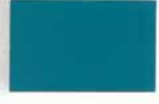
DEEP WATER GREEN